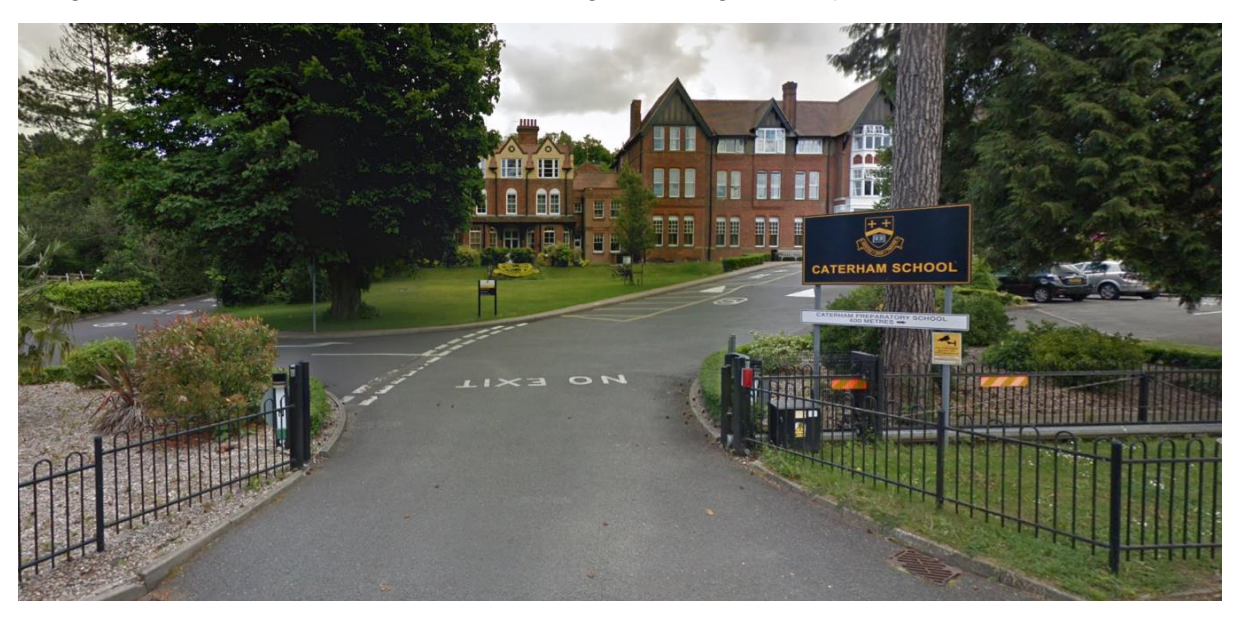
Image of the Performing Arts Centre building where you register. See photo below

Image of the senior school entrance. Parking on the right. See photo below: